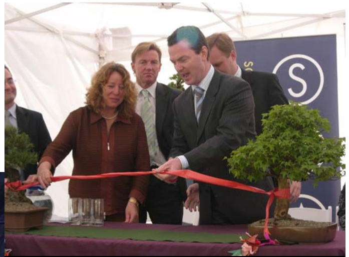
Launch of Bonsai—The Imagination tree Federal Minister Christopher Pyne cutting the ribbon; (L) James Merlino, MP for Monbulk, Caroline Crosse, John Thwaites Deputy Premier and Tony Smith, MP for Casey (partially obscured)